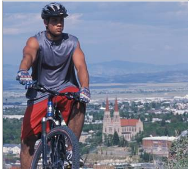
Commuting is a breeze in Helena, Mont. The typical drive to work is shorter here than in every mic making this town No. 5 on bizjournals' list of American "dreamtowns."

The study was inspired by the heavy public interest in small-town life. Its aim was to identify communities that would be most attractive to people considering such a move. The highest scores went to well-rounded places with light traffic, healthy economies, moderate costs of living, impressive housing stocks, strong educational systems, and easy access to big-city attractions.