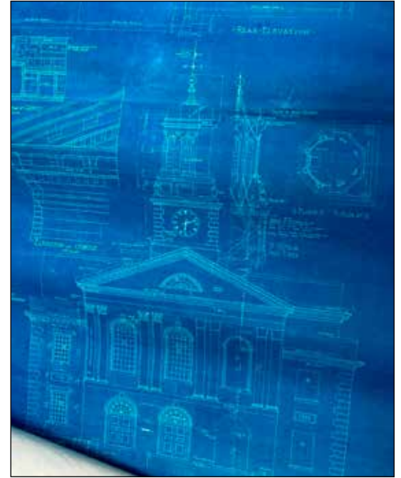
1923 blueprint of City Hall

Members are also excited about an upcoming discussion with JAM (CATV) to explore the production of a video about Lebanon that addresses the native and indigenous people's history in Lebanon.