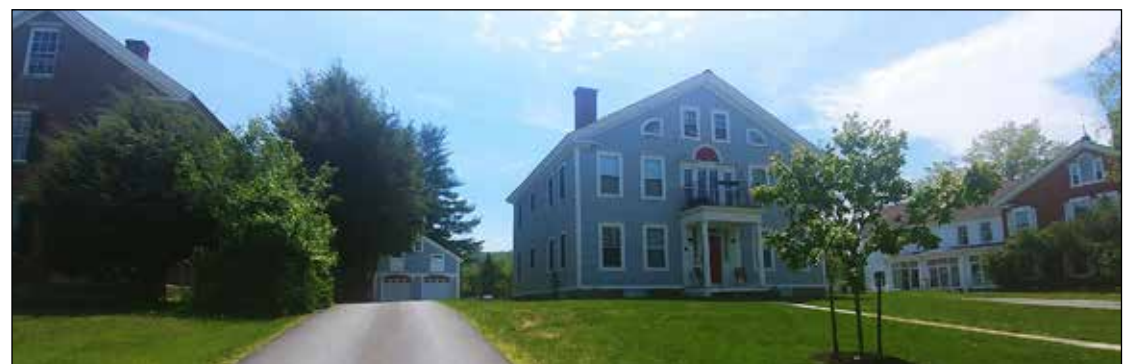
4 South Park Street, a designated Lebanon Historic Landmark that has undergone two renovations supervised by the Heritage Commission

An ongoing focus of the Commission is oversight